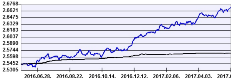
--- Aegon Alfa Total Return Investment Fund HUF series _____ Benchmark

Past performance is no guarantee of future results. This report should not be considered as an offer or investment advisory. The Fund Prospectus contains the detailed conditions of the investment. The distribution costs of the fund purchase can be found at the distributors.