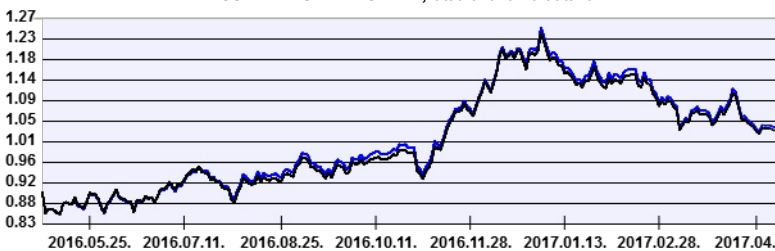
NET ASSET VALUE PER SHARE, 05/01/2016 - 04/30/2017

— Aegon Russia Equity Fund PLN series — Benchmark