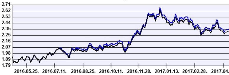
NET ASSET VALUE PER SHARE, 05/01/2016 - 04/30/2017

— Aegon Russia Equity Fund institutional series — Benchmark