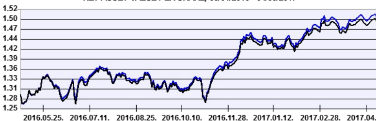
NET ASSET VALUE PER SHARE, 05/01/2016 - 04/30/2017

— Aegon International Equity Fund institutional series — Benchmark