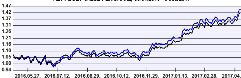
NET ASSET VALUE PER SHARE, 05/01/2016 - 04/30/2017

Past performance is no guarantee of future results. This report should not be considered as an offer or investment advisory. The Fund Prospectus contains the detailed conditions of the investment. The distribution costs of the fund purchase can be found at the distributors