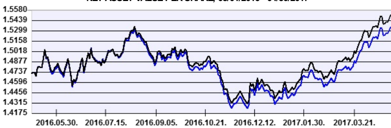
NET ASSET VALUE PER SHARE, 05/01/2016 - 04/30/2017

— Aegon Polish Bond Fund HUF series — Benchmark