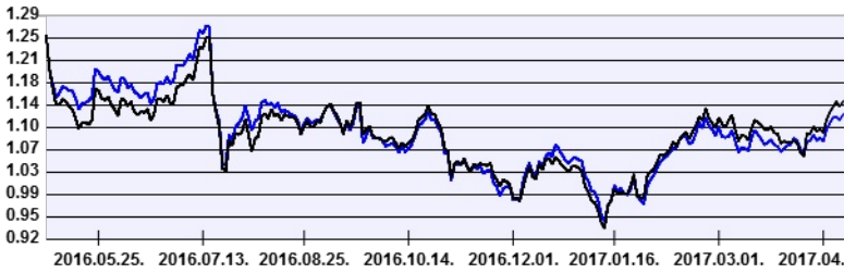
NET ASSET VALUE PER SHARE, 05/01/2016 - 04/30/2017

— Aegon IstanBull Equity Fund PI series — Benchmark