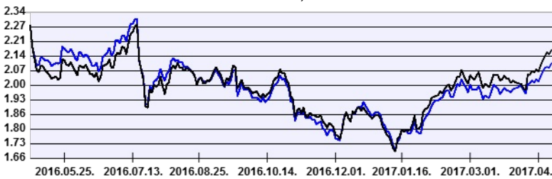
NET ASSET VALUE PER SHARE, 05/01/2016 - 04/30/2017

— Aegon IstanBull Equity Fund HUF series — Benchmark