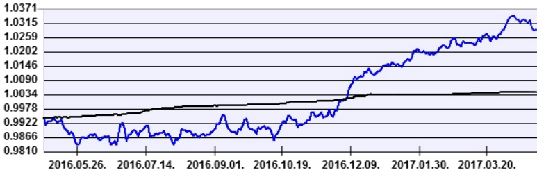
NET ASSET VALUE PER SHARE, 05/01/2016 - 04/30/2017

— Aegon Alfa Total Return Investment Fund USD series — Benchmark