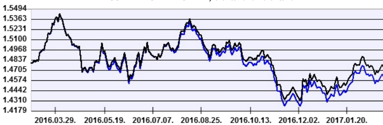
NET ASSET VALUE PER SHARE, 02/29/2016 - 02/28/2017

— Aegon Polish Bond Fund HUF series — Benchmark