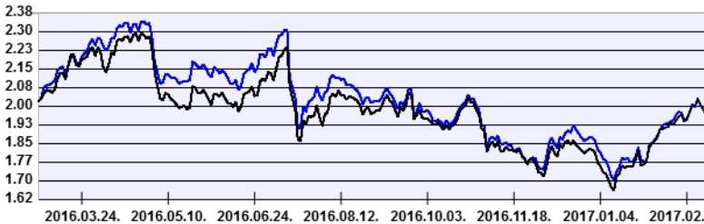
NET ASSET VALUE PER SHARE, 02/29/2016 - 02/28/2017

— Aegon IstanBull Equity Fund HUF series — Benchmark