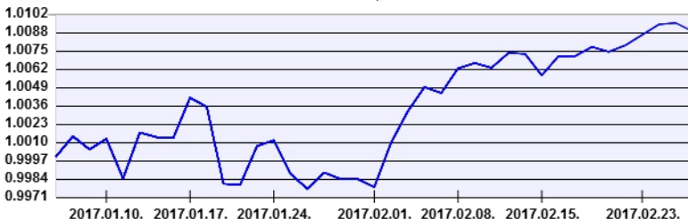
— Aegon Emerging Europe Bond Fund USD series

Past performance is no guarantee of future results. This report should not be considered as an offer or investment advisory. The Fund Prospectus contains the detailed conditions of the investment. The distribution costs of the fund purchase can be found at the distributors