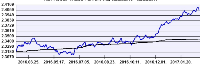
NET ASSET VALUE PER SHARE, 02/29/2016 - 02/28/2017

— Aegon Alfa Total Return Investment Fund PLN series — Benchmark