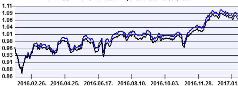
NET ASSET VALUE PER SHARE, 02/01/2016 - 01/31/2017

— Aegon International Equity Fund EUR series — Benchmark