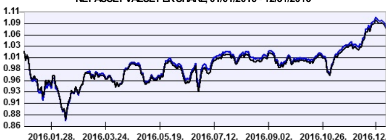
NET ASSET VALUE PER SHARE, 01/01/2016 - 12/31/2016

— Aegon International Equity Fund EUR series — Benchmark