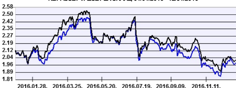
NET ASSET VALUE PER SHARE, 01/01/2016 - 12/31/2016

— Aegon Istanbul Equity Fund institutional series — Benchmark