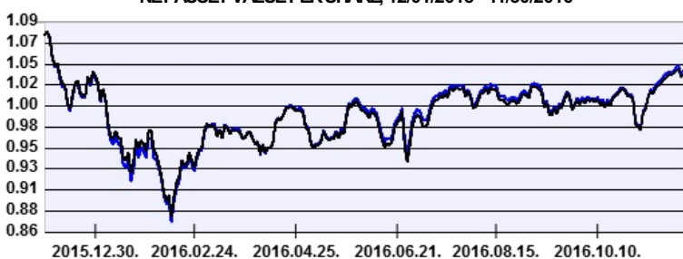
NET ASSET VALUE PER SHARE, 12/01/2015 - 11/30/2016

— Aegon International Equity Fund EUR series — Benchmark