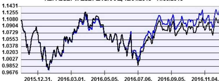
NET ASSET VALUE PER SHARE, 12/01/2015 - 11/30/2016

— Aegon Polish Equity Fund institutional series — Benchmark