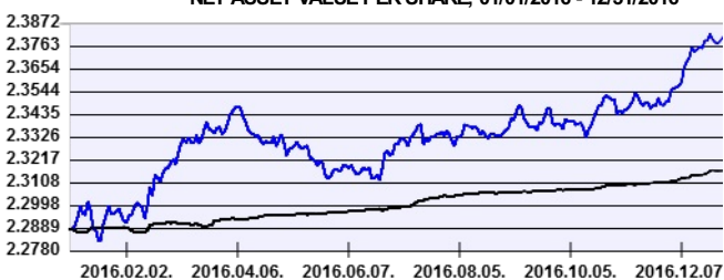
NET ASSET VALUE PER SHARE, 01/01/2016 - 12/31/2016

— Aegon Alfa Total Return Investment Fund PLN series — Benchmark