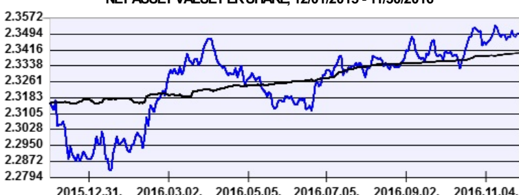
NET ASSET VALUE PER SHARE, 12/01/2015 - 11/30/2016

— Aegon Alfa Total Return Investment Fund PLN series — Benchmark