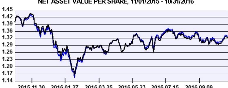
NET ASSET VALUE PER SHARE, 11/01/2015 - 10/31/2016

— Aegon International Equity Fund institutional series — Benchmark