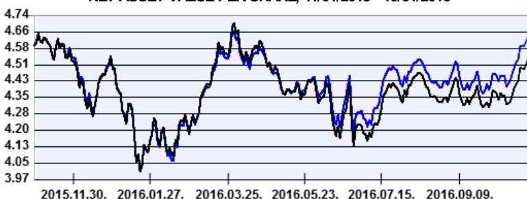
NET ASSET VALUE PER SHARE, 11/01/2015 - 10/31/2016

— Aegon Central European Equity Fund institutional series — Benchmark Past performance is no guarantee of future results. This report should not be considered as an offer or investment advisory. The Fund Prospectus contains the detailed conditions of the investment. The distribution costs of the fund purchase can be found at the distributors.