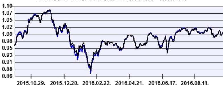
NET ASSET VALUE PER SHARE, 10/01/2015 - 09/30/2016

— Aegon International Equity Fund EUR series — Benchmark