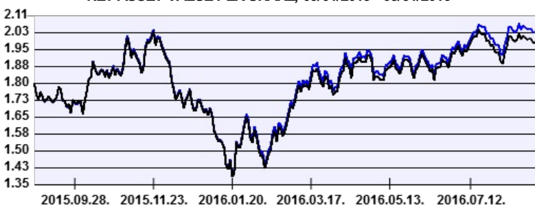
NET ASSET VALUE PER SHARE, 09/01/2015 - 08/31/2016

— Aegon Russia Equity Fund institutional series — Benchmark