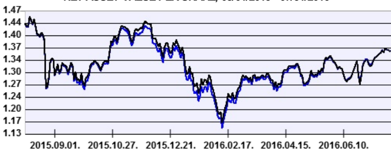
NET ASSET VALUE PER SHARE, 08/01/2015 - 07/31/2016

— Aegon International Equity Fund institutional series — Benchmark