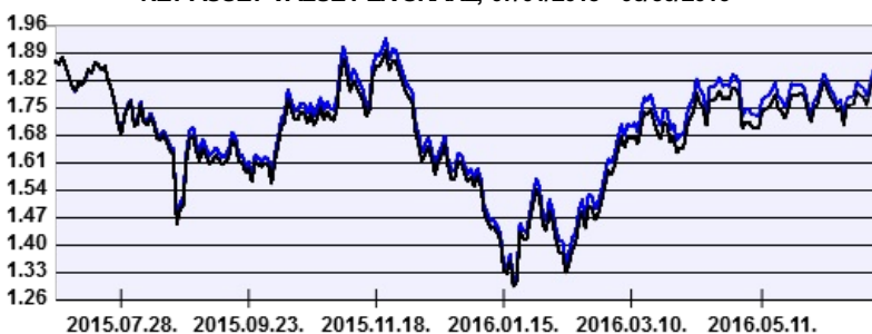
NET ASSET VALUE PER SHARE, 07/01/2015 - 06/30/2016

— Aegon Russia Equity Fund HUF series — Benchmark