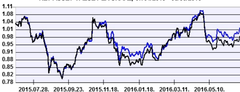
NET ASSET VALUE PER SHARE, 07/01/2015 - 06/30/2016

— Aegon IstanBull Equity Fund PLN series — Benchmark