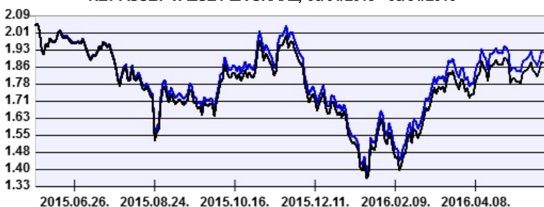
NET ASSET VALUE PER SHARE, 06/01/2015 - 05/31/2016

— Aegon Russia Equity Fund institutional series — Benchmark