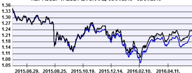
NET ASSET VALUE PER SHARE, 06/01/2015 - 05/31/2016

— Aegon Climate Change Equity Fund HUF series — Benchmark