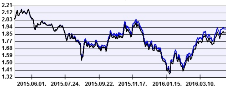
NET ASSET VALUE PER SHARE, 05/01/2015 - 04/30/2016

— Aegon Russia Equity Fund institutional series — Benchmark