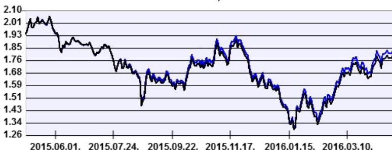
NET ASSET VALUE PER SHARE, 05/01/2015 - 04/30/2016

— Aegon Russia Equity Fund HUF series — Benchmark