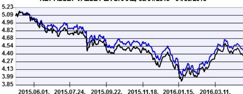
NET ASSET VALUE PER SHARE, 05/01/2015 - 04/30/2016

— Aegon Central European Equity Fund institutional series — Benchmark