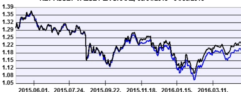
NET ASSET VALUE PER SHARE, 05/01/2015 - 04/30/2016

— Aegon Climate Change Equity Fund HUF series — Benchmark