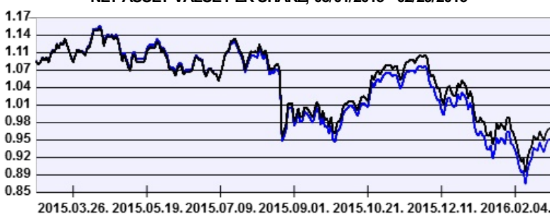
NET ASSET VALUE PER SHARE, 03/01/2015 - 02/29/2016

— Aegon International Equity Fund EUR series — Benchmark