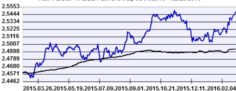
NET ASSET VALUE PER SHARE, 03/01/2015 - 02/29/2016

— Aegon Alfa Derivative Fund HUF series — Benchmark