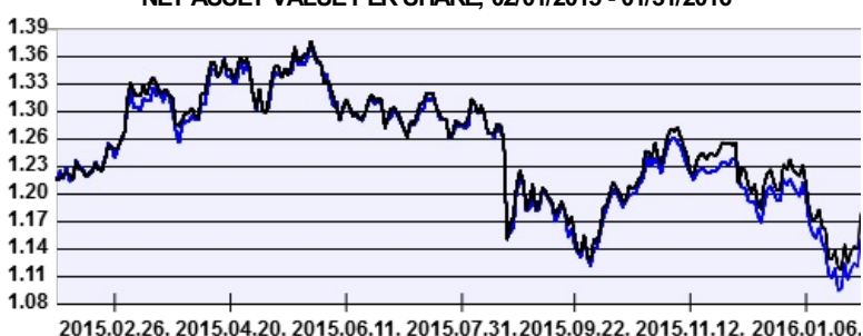
NET ASSET VALUE PER SHARE, 02/01/2015 - 01/31/2016

— Aegon Climate Change Equity Fund HUF series — Benchmark