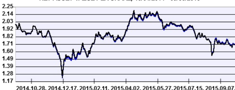
NET ASSET VALUE PER SHARE, 10/01/2014 - 09/30/2015

— Aegon Russia Equity Fund institutional series — Benchmark