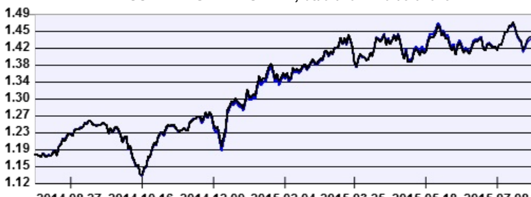
NET ASSET VALUE PER SHARE, 08/01/2014 - 07/31/2015

— Aegon International Equity Fund institutional series — Benchmark