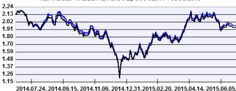
NET ASSET VALUE PER SHARE, 07/01/2014 - 06/30/2015

— Aegon Russia Equity Fund institutional series — Benchmark