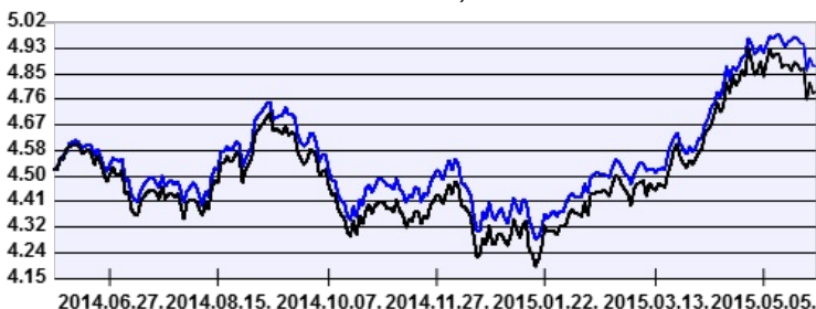
NET ASSET VALUE PER SHARE, 06/01/2014 - 05/31/2015

— Aegon Central European Equity Fund HUF series — Benchmark