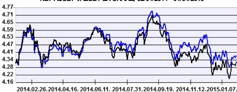
NET ASSET VALUE PER SHARE, 02/01/2014 - 01/31/2015

— AEGON Central European Equity Fund HUF series — Benchmark