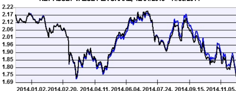
NET ASSET VALUE PER SHARE, 12/01/2013 - 11/30/2014

— AEGON Russia Equity Fund institutional series — Benchmark