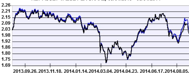
NET ASSET VALUE PER SHARE, 09/01/2013 - 08/31/2014

— AEGON Russia Equity Fund institutional series — Benchmark