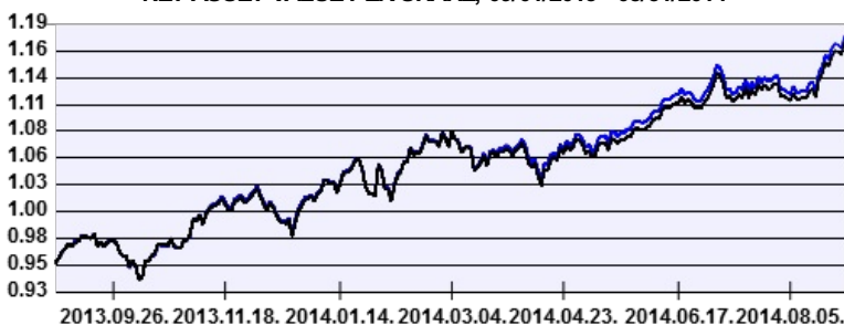
NET ASSET VALUE PER SHARE, 09/01/2013 - 08/31/2014

— AEGON International Equity Fund HUF series — Benchmark