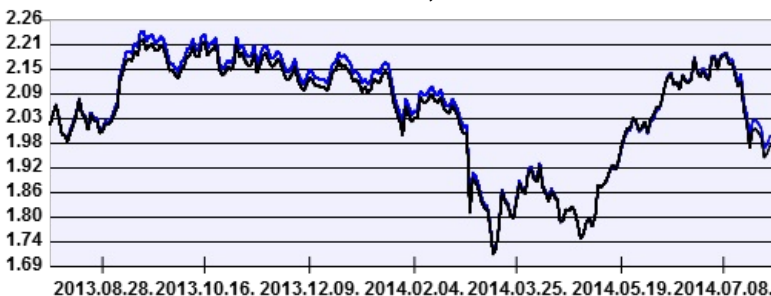
NET ASSET VALUE PER SHARE, 08/01/2013 - 07/31/2014

— AEGON Russia Equity Fund institutional series — Benchmark