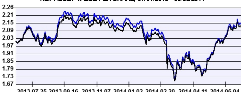
NET ASSET VALUE PER SHARE, 07/01/2013 - 06/30/2014

Past performance is no guarantee of future results. This report should not be considered as an offer or investment advisory. The Fund Prospectus contains the detailed conditions of the investment. The distribution costs of the fund purchase can be found at the distributors.