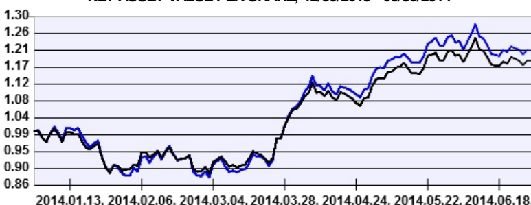
NET ASSET VALUE PER SHARE, 12/30/2013 - 06/30/2014

— AEGON IstanBull Equity Fund PI series — Benchmark