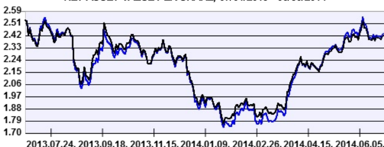
NET ASSET VALUE PER SHARE, 07/01/2013 - 06/30/2014

— AEGON IstanBull Equity Fund institutional series — Benchmark