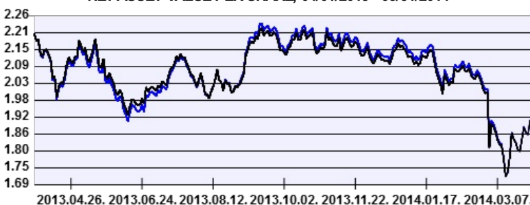
NET ASSET VALUE PER SHARE, 04/01/2013 - 03/31/2014

— AEGON Russia Equity Fund institutional series — Benchmark