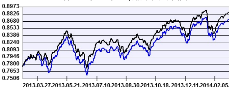
NET ASSET VALUE PER SHARE, 03/01/2013 - 02/28/2014

— AEGON International Equity Fund EUR series — Benchmark